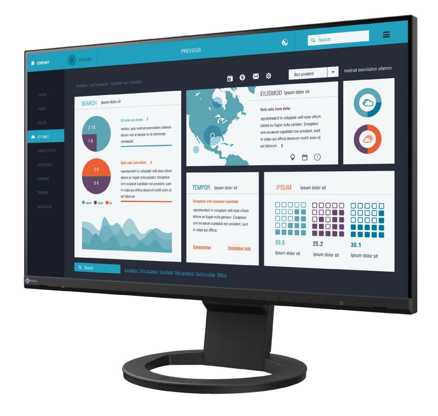
The 23.8 - inch FlexScan EV2490 is a frameless LCD monitor equipped with USB Type-C for improving productivity and comfort at the office or at home.